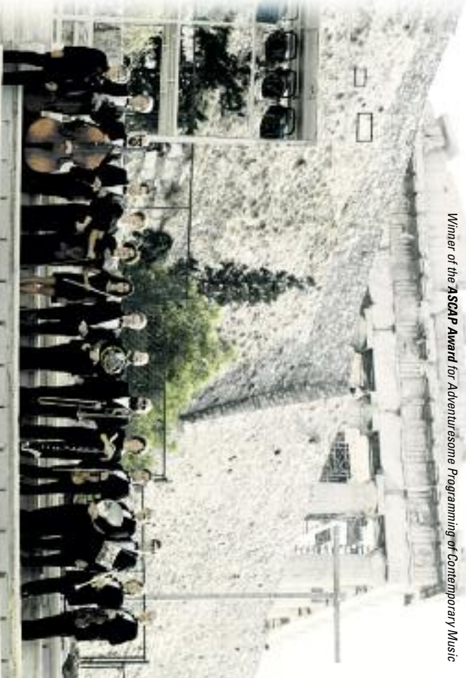
Winner of the ASCAP Award for Adventurous Programming of Contemporary Music