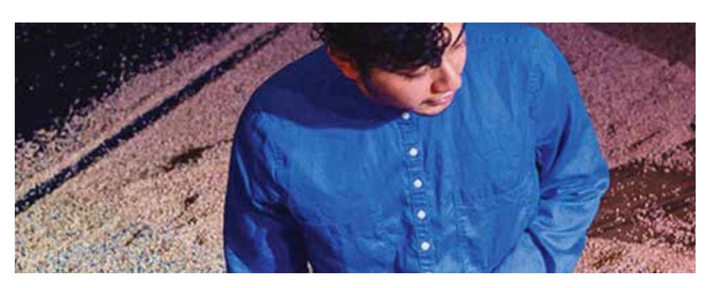
March 22-23, 2017 Oberon 2 Arrow St. Cambridge

A transgender man from Afghanistan immigrates to the American South in this world premiere opera about a collision of cultures that shakes the foundations of what it means to be an American in a post-9/11 world. Music by Leo Hurley. Libretto by Charles Osbourne.